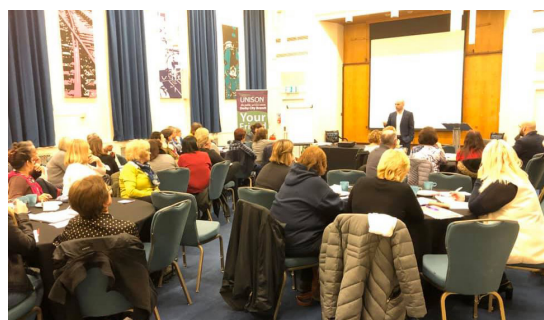
Fantastic turn out at the Equal Pay Meeting tonight, thank you to all those that attended. For those who couldn't make it don't hesitate to get in touch with us to keep updated on future

Since being voted in as chair in September, I have chaired a few meetings and will be chairing the AGM! Hope to see you all there on the 21st February 2020.