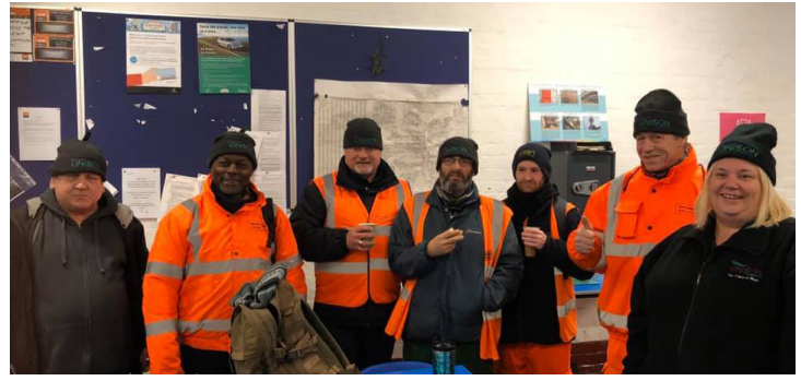
It was Great to say hello and thankyou with breakfast bright an early to our members at stores road earlier this week. these are just a few of those who provide vital services across Derby every day.

I am also part of the Steering group for the Work Stress Network where i keep upto date with current issue and information relating to work stress for our members.